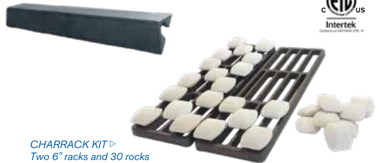
CHARRACK KIT▷ Two 6" racks and 30 rocks